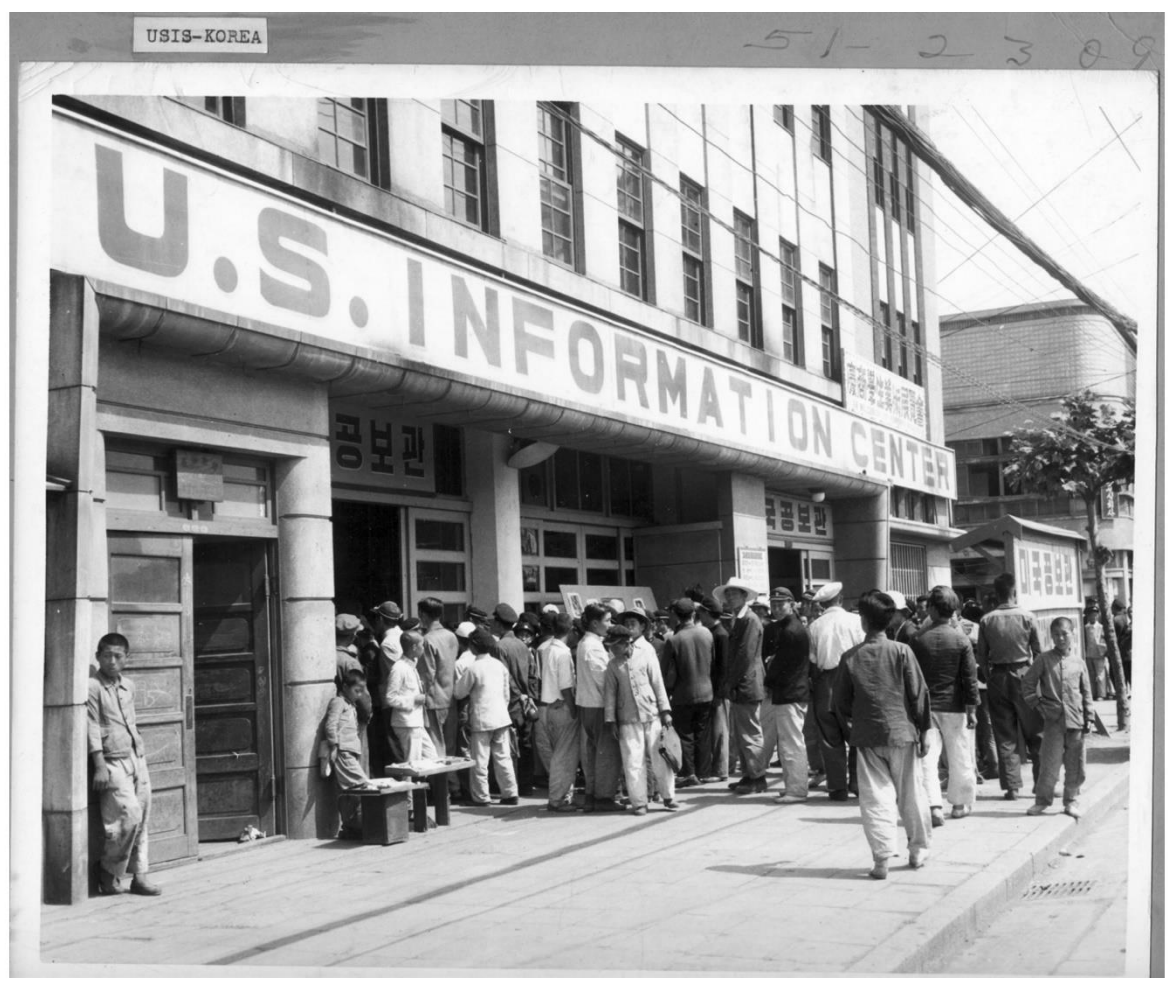
Figure 1: USIS Pusan branch, 1951

Under exigent circumstances of the war, USIS newsreels were "designed to support the efforts of the Korean government and the U.S. in fighting the war. It was clearly propaganda. We called the communists just about every vile name you could think of, and used all kinds of statistics and facts that would bolster morale. It was the Korean government's policy to foster hatred of the communists."<sup>55</sup> The focus on the war was in response to the revised wartime aims and objectives of the USIS program in Korea, which included coordinating its operations with the "psychological warfare operations of the United Nations Command (in Tokyo) and its military forces in Korea" to give them tactical support.<sup>56</sup>